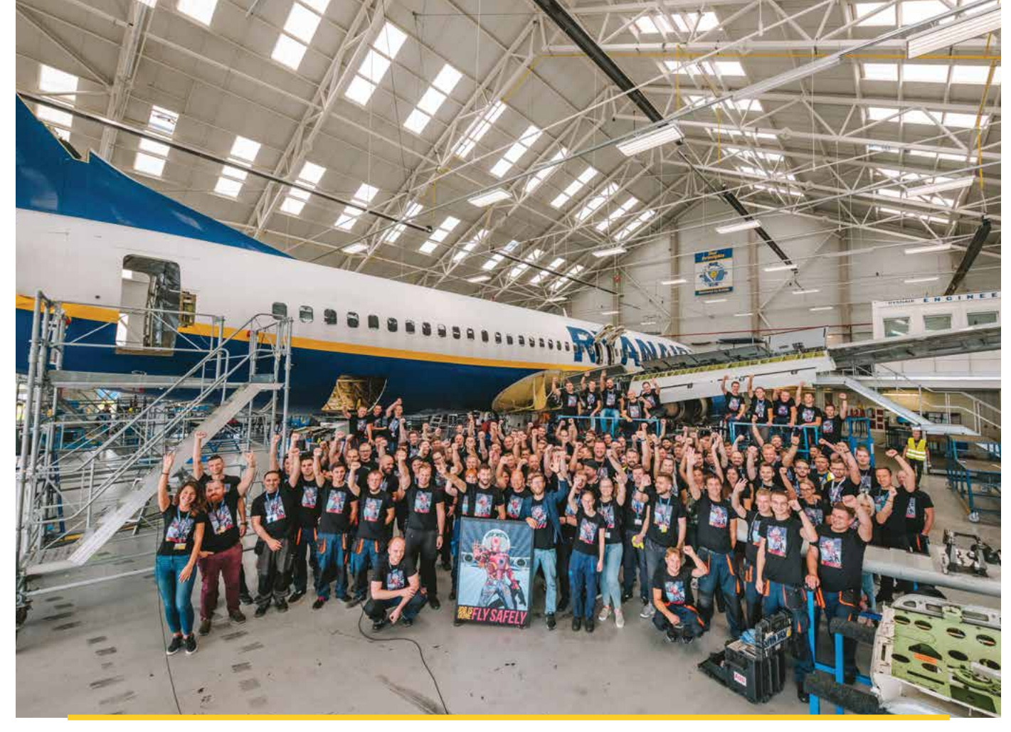
Kaunas International Airport (KUN), Lituania.

As we began to see a post-Covid recovery in air travel and tourism in Spring 2022, we moved quickly with our Trade Unions to negotiate accelerated pay restoration agreements, so that we can restore all previously agreed pay cuts as soon as our business and profitability returns to pre-Covid levels.