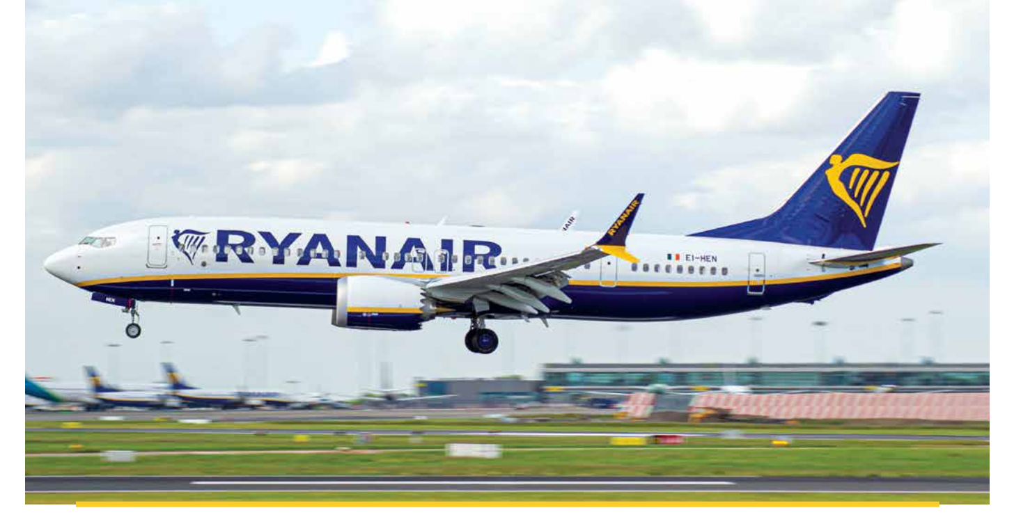
The B737 "Gamechanger".

The Board considers the results of the evaluation process and any issues identified. The above evaluations were conducted in May 2021 and were presented to the Board at the September 2021 Board meeting in respect of the year under review. The May 2022 evaluations will be presented to the Board at the September 2022 Board meeting. The Board intends to undertake an externally facilitated performance evaluation in the coming 12 to 18 months.